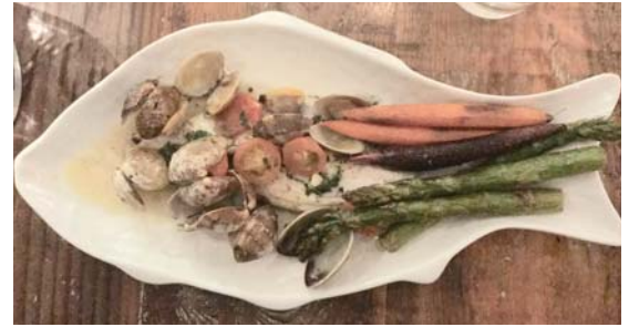
Enzo’s favorite branzino, Mediterranean sea bass

The restaurant is open Tuesday thru Sunday, from 11:30 a.m. until 10 p.m. Reservations can be made through Yelp or by calling (925) 310-4337, but walk-ins are welcome too. Parking is easy and free on the street or in the rear parking lot.